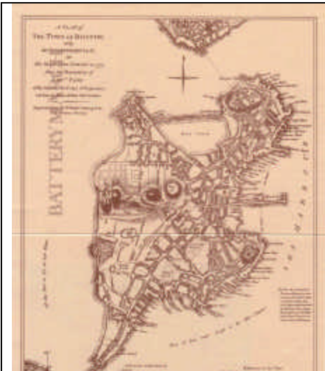
Annual Reports 1973 - 1978