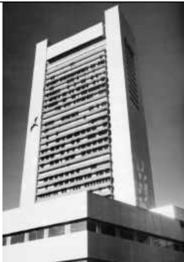
Federal Reserve Bank, Boston