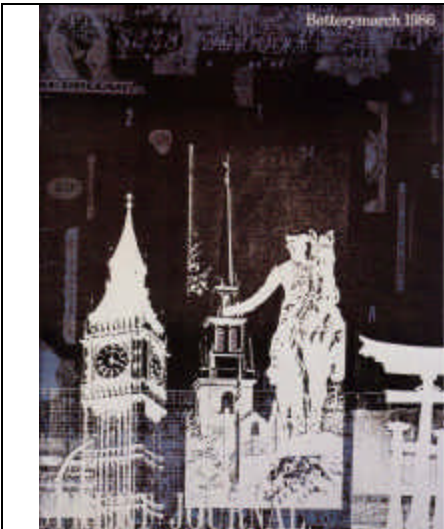
Annual Report 1986