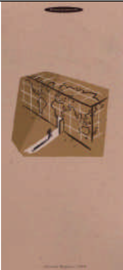
Annual Report 1990